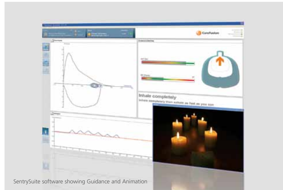
SentrySuite software showing Guidance and Animation