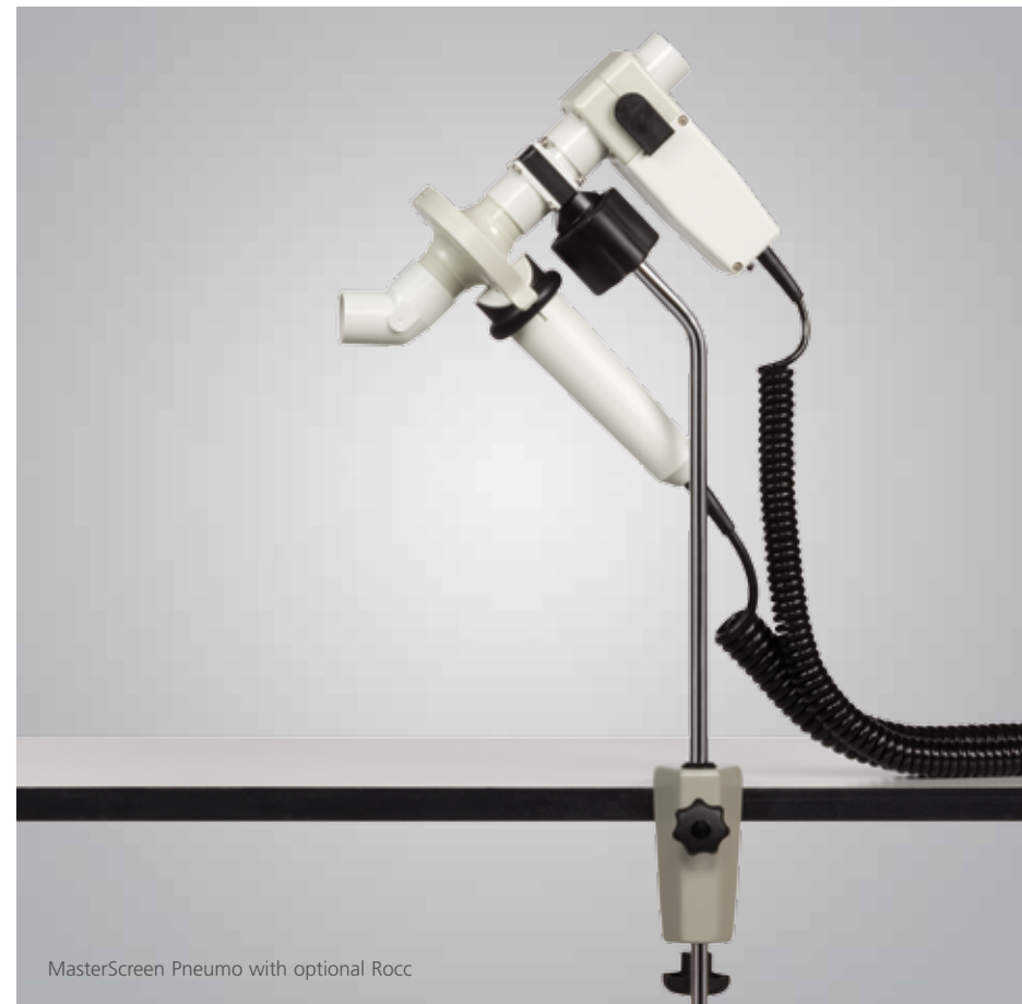
MasterScreen Pneumo with optional Rocc