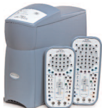
Alice LDx system with LDxS and LDxN head box.

Sleepware G3 features an exclusive composite channel type, useful when titrating complex sleep apnea patients with the BiPAP autoSV Advanced. The channel integrates the various parameters available from the BiPAP autoSV so a clinician can see the relationships of the various parameters on a breath-to-breath basis. Additionally this composite channel allows the clinician to eliminate the redundant channels from view which provides them with better screen visibility to all of the data.